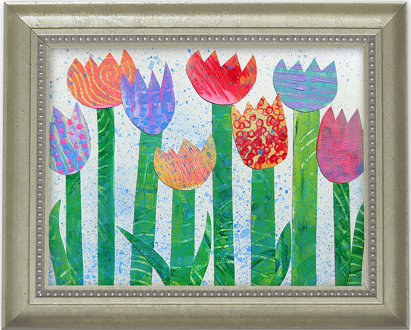
Everything's Coming Up Tulips